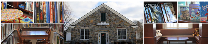
Chesterfield Public Library June 2025 Events