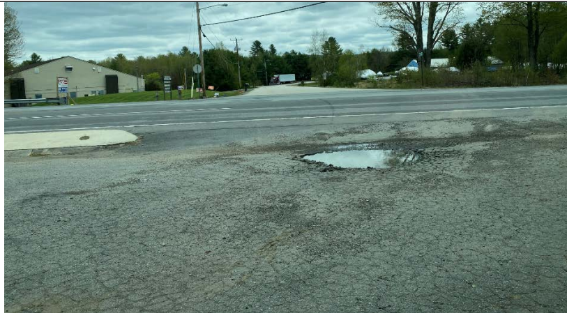
View from travel lane on Stow Drive facing Loney's westerly entrance